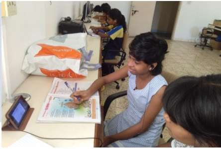
Attending online classes