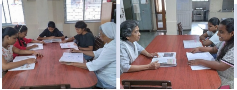
Sisters assisting the girls with lessons