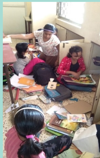
Bed-making and cleaning