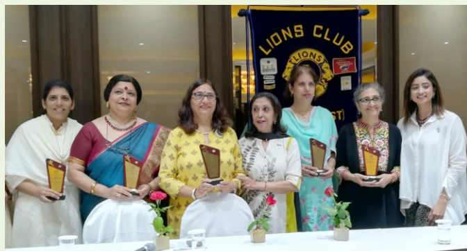
Teacher's Award. The Lions Club of Bombay Host gave an appreciation reward for uplifting the underprivileged in four schools in Mumbai. –The Principals were presented with a plant and appreciation award with a sumptuous dinner at Hotel West End, New Marine lines. We thank them for their encouragement and appreciation.