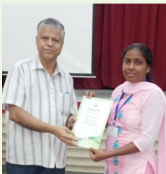
St. Anne's Mumbai AFJM's interacted with our Children