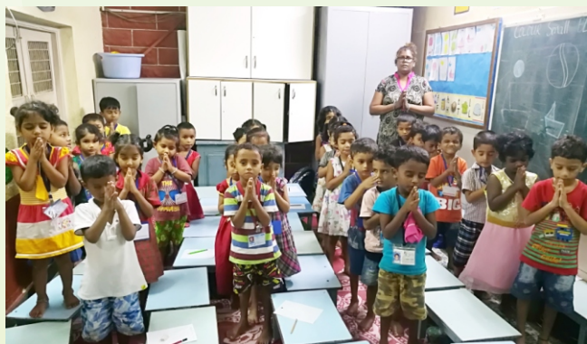
Final Examination close of the Academic year 2018-19.