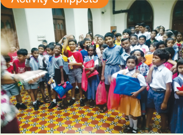
Outreach at Cathedral