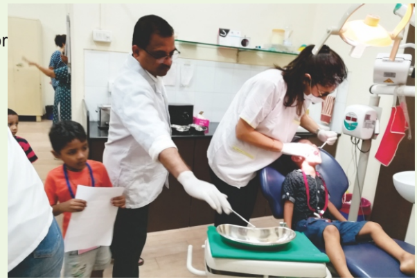
Medical check up for the Kharghar girls by the IWA