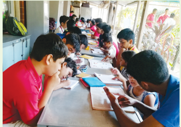
Campion boys tutoring our Garden School sponsored children; an act of charity and service.