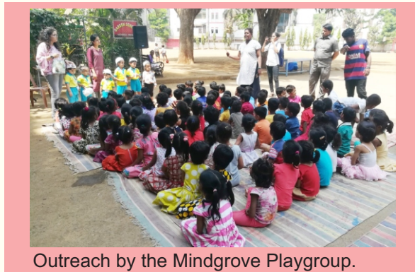
Outreach by the Mindgrove Playgroup.