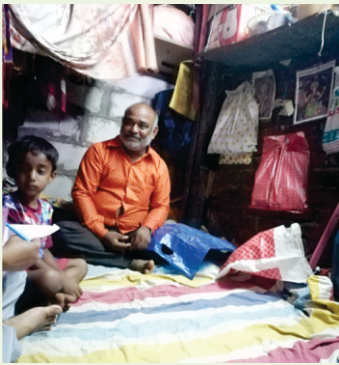
Slum survey – In order to effectively reach out to the poorest of the poor we undertake a survey on the slums