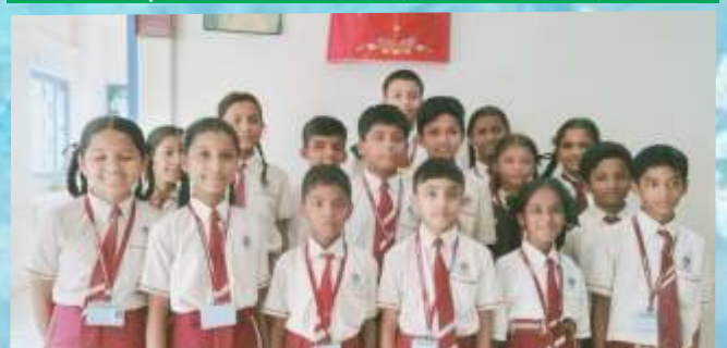
St. Stephen's School (32 children)