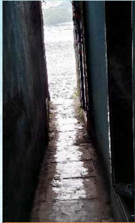
Back waters in homes during high tide.