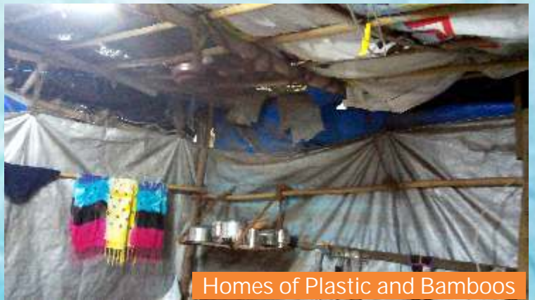
Homes of Plastic and Bamboos