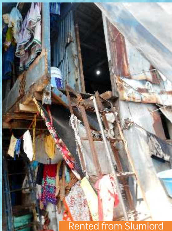
Rented from Slumlord