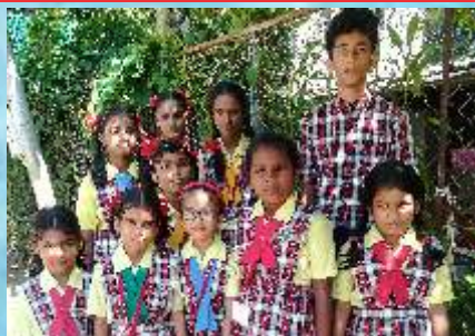
Bai Kabi Bai School (15 Children)