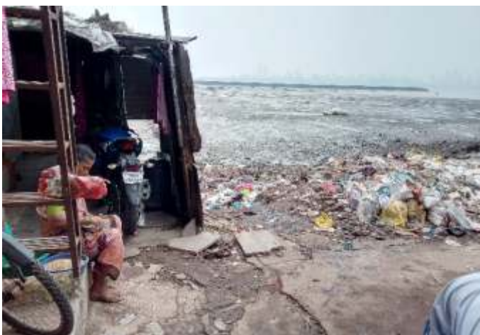
Garbage around their homes