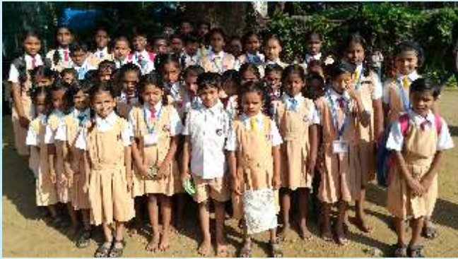
St. Josephs School ( 55)