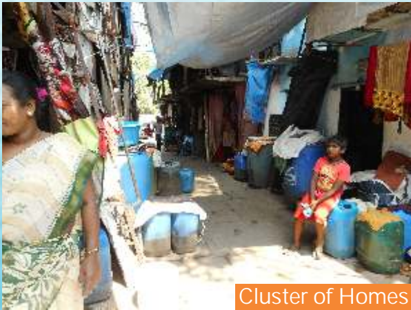
Cluster of Homes