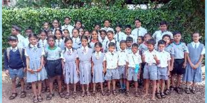
Holy Name High School (81)