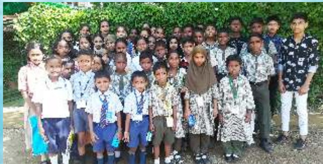
Students from Reay Road (60 children)