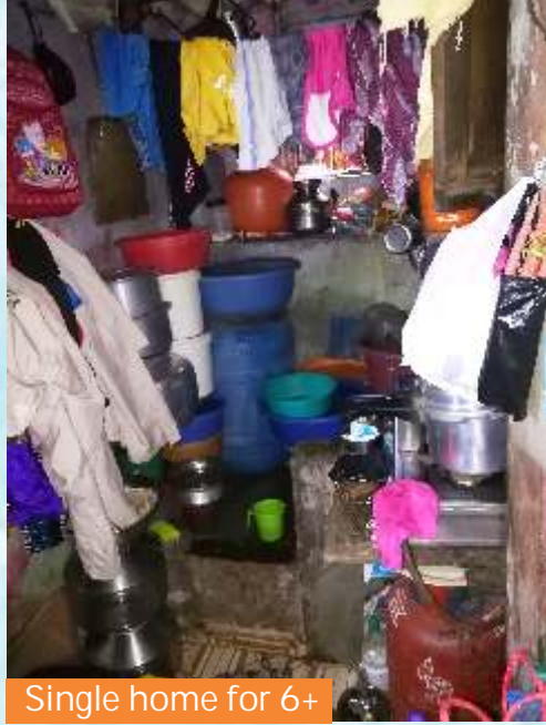
Single home for 6+