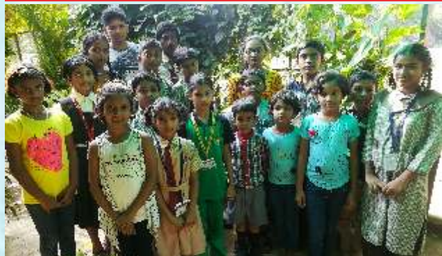
Students from other schools (48)