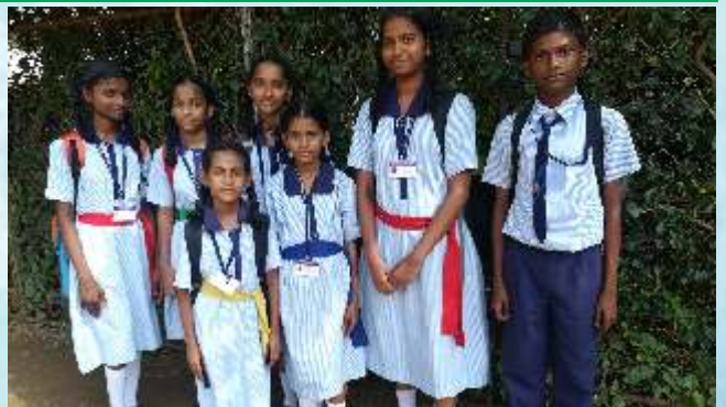
Sir J.J. School (14) Children