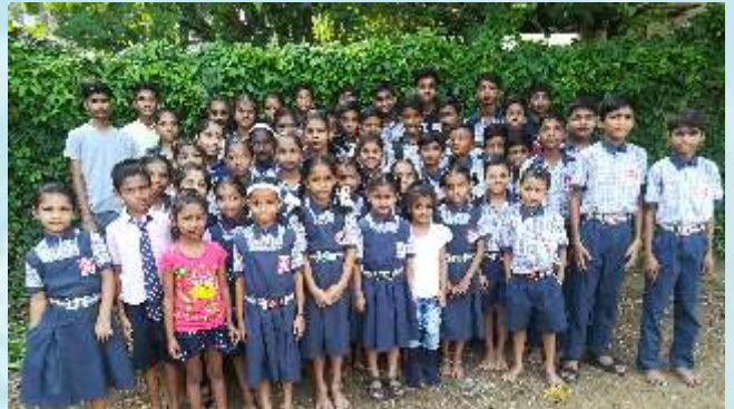
Little Flower High School (55 children)